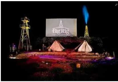
Roma Explorers Inn | 1 night

in Australia to Yuleba and then onto Wallumbilla. Arriving in Roma we have some free time at the motel before tonight's entertainment – Roma's Big Rig Night Show . The Night Show is an outdoor cinema with an interactive display depicting a traditional oil rig site. The show itself is thoroughly entertaining, giving an overview of the discovery of Oil and Gas in Roma and the progression of the industry in Australia.