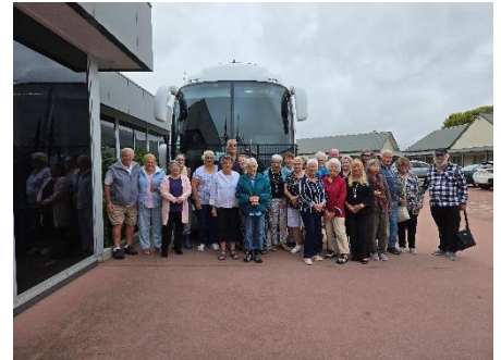
Port Bus 2025 Group